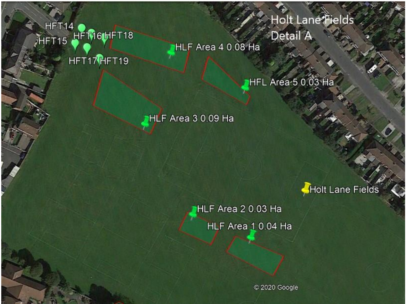
Detail A – Gated access from Council St and pedestrian from Sandhurst Rd