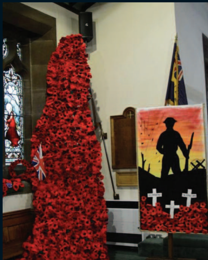
Cascading poppies made by Parishioners for the virtual Remembrance Sunday video from St Ann's Church and the War Memorial