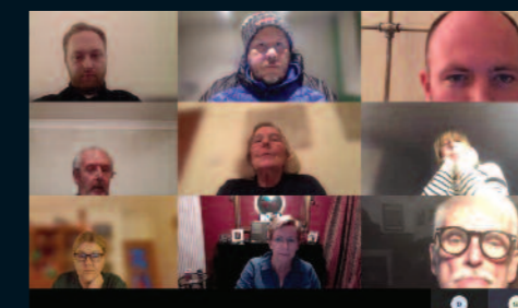
Parish Council meetings and business continued via Teams meetings.