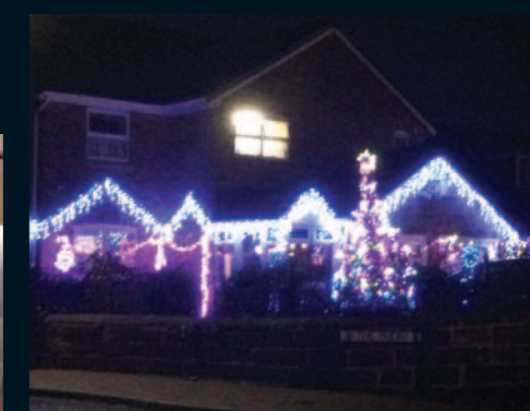
One of the many amazing decorations by residents as part of the Christmas Tree Festival.