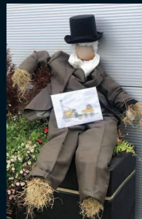
Rainhill Parish Councillors contribution to the Scarecrow Festival.